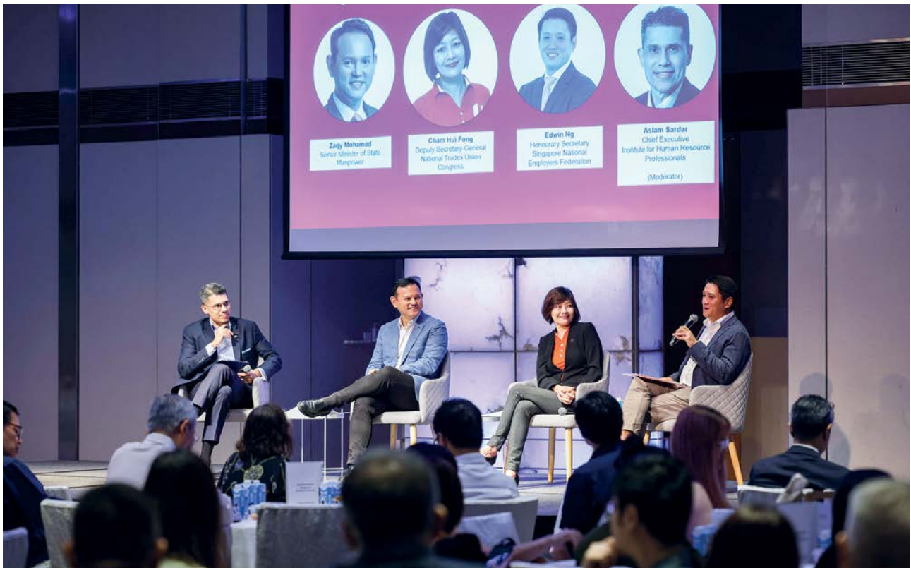
The Committee members at the dialogue on Workplace Fairness held on 23 March 2023.