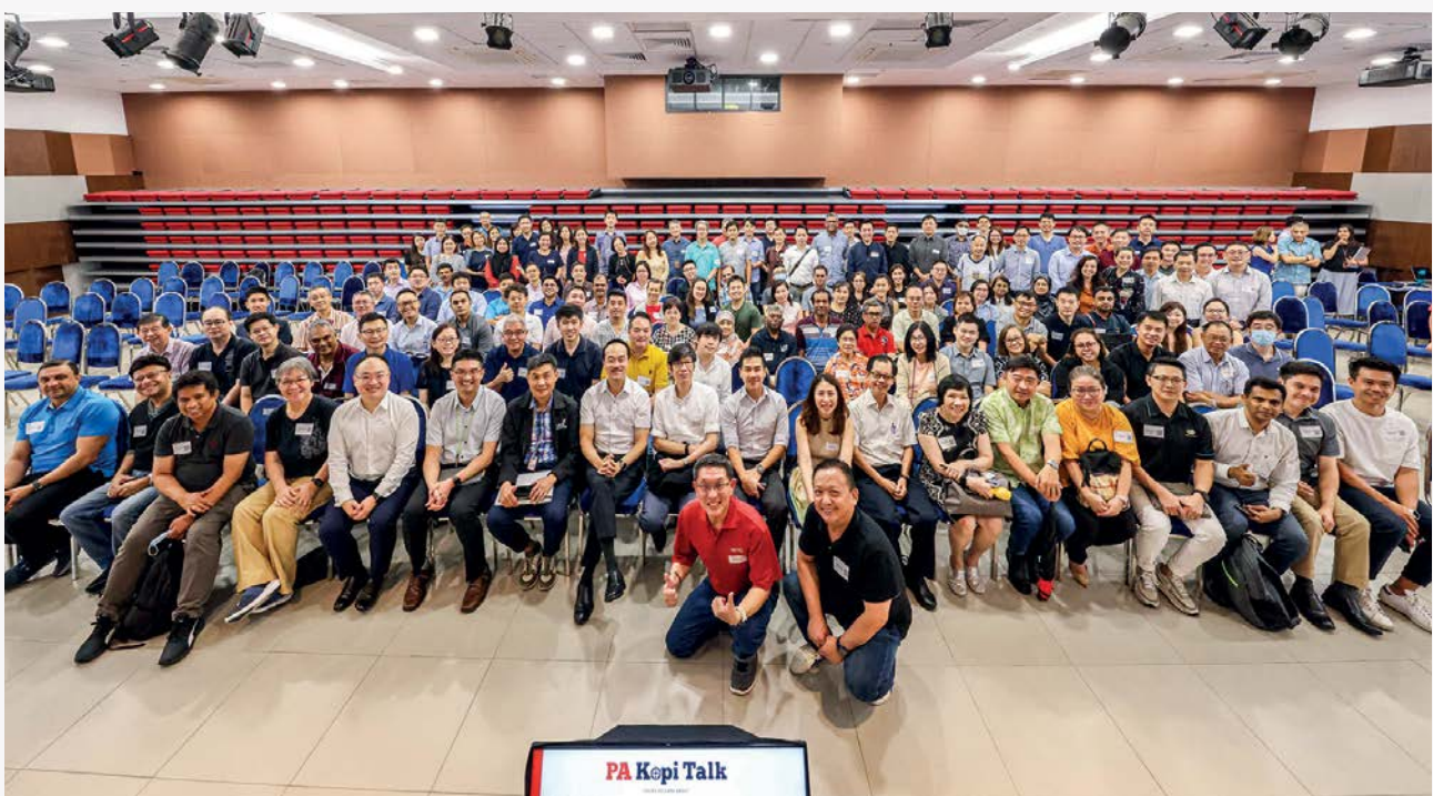
Dialogue session held with Grassroot Leaders and community partners on 21 March 2023.